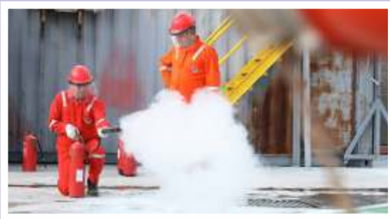
FIRE FIGHTING DRILL